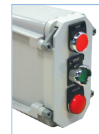
NEW JBX 634